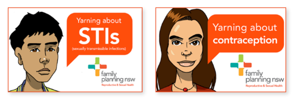
Family Planning NSW has developed a suite of Aboriginal specific resources to provide culturally appropriate reproductive and sexual health information to Aboriginal and Torres Strait Islander communities

In NSW the situation is particularly acute in rural and remote areas.