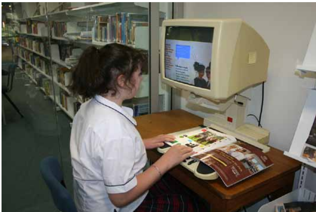
Electronic magnifiers limit the amount of the page visible at a time