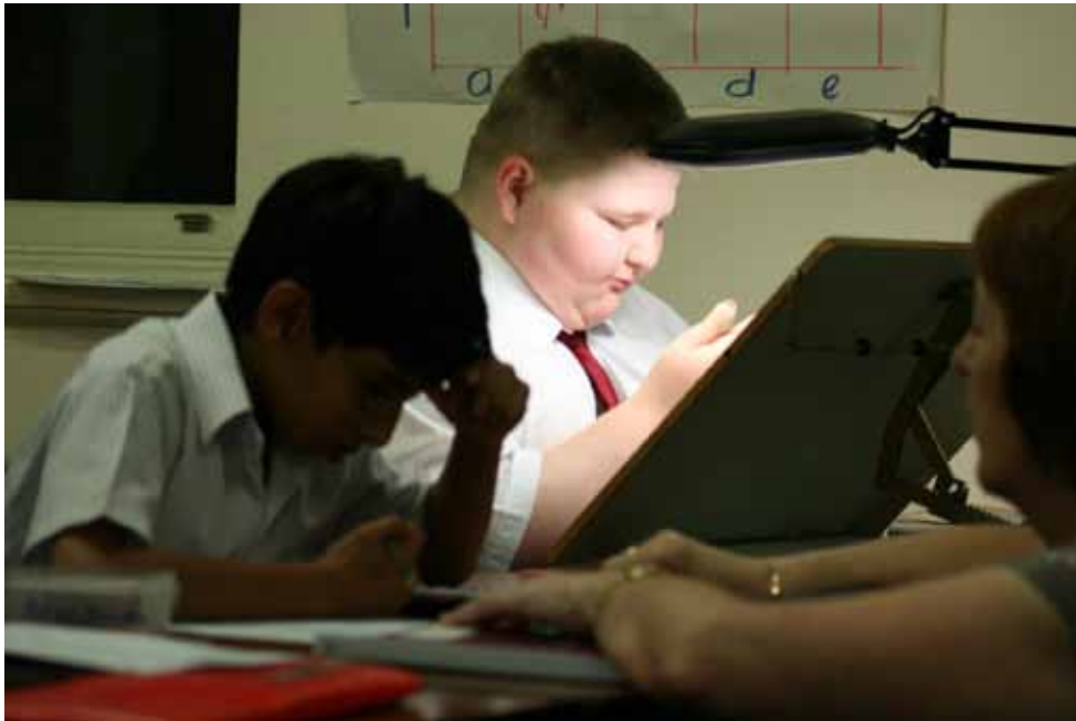
Some people rely on their remaining vision to read